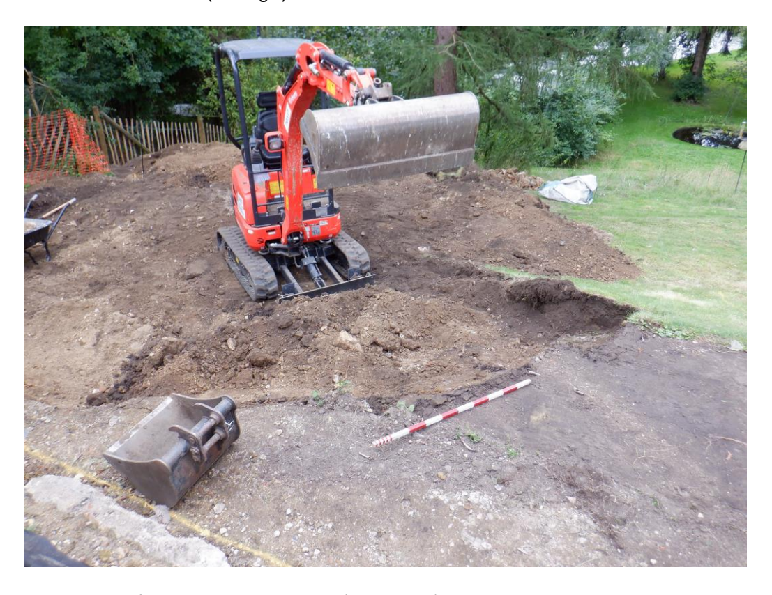
Plate 2. View of site reduction in progress (looking SSE)