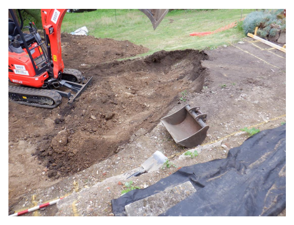
Plate 4. View of site reduction (looking S)