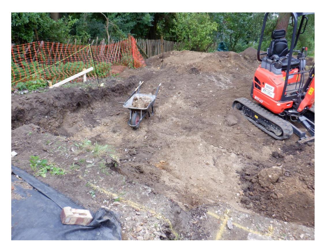
Plate 3. View of site reduction (looking SE)