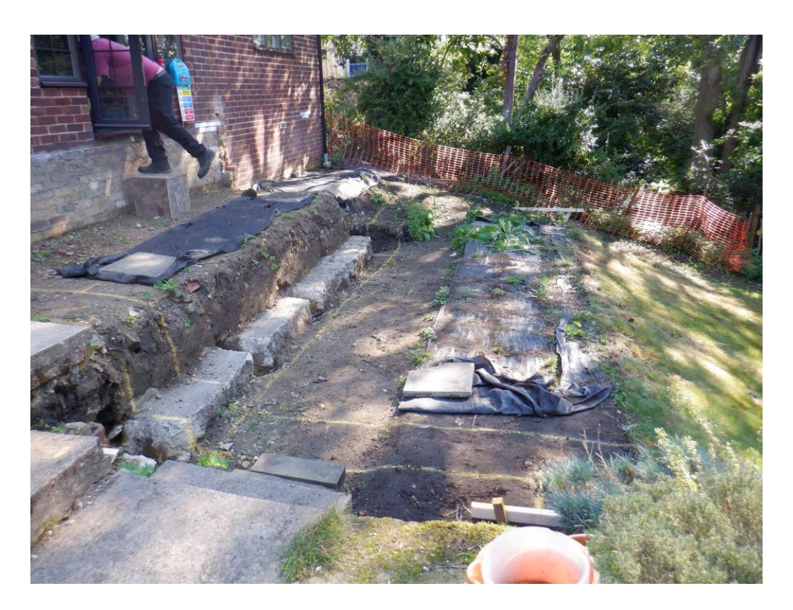
Plate 1. View of the site (looking E)