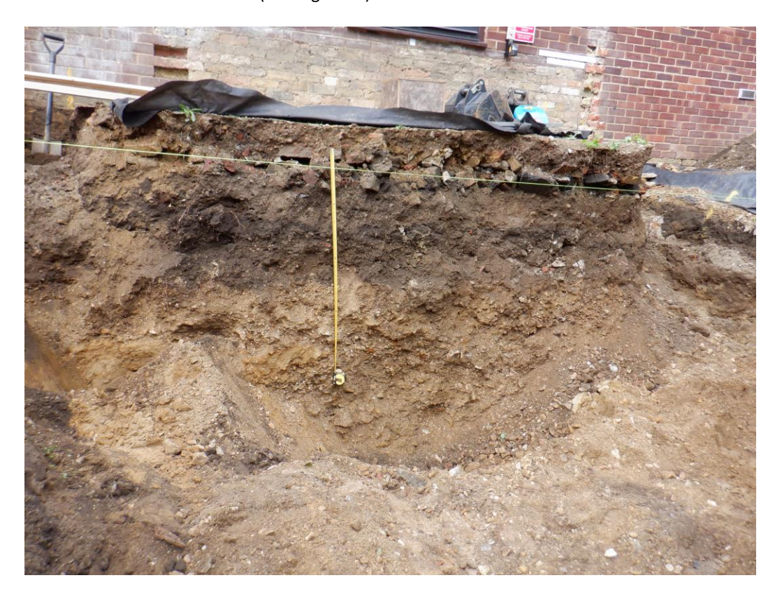
Plate 6. Site reduction completed (looking N)