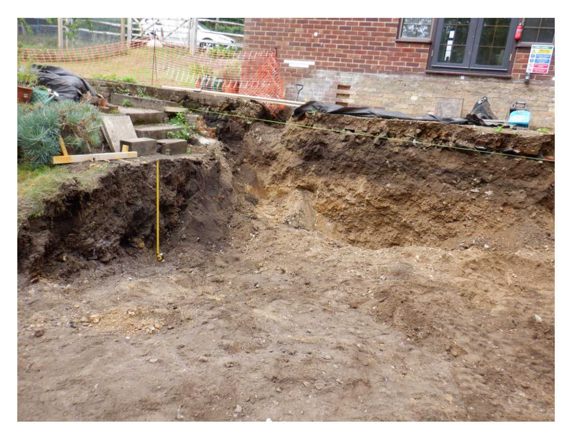
Plate 5. View of excavated site (looking NNW)